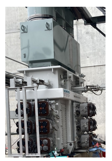
Figure 3- External connection box to connect the single phase transformers to bank configuration