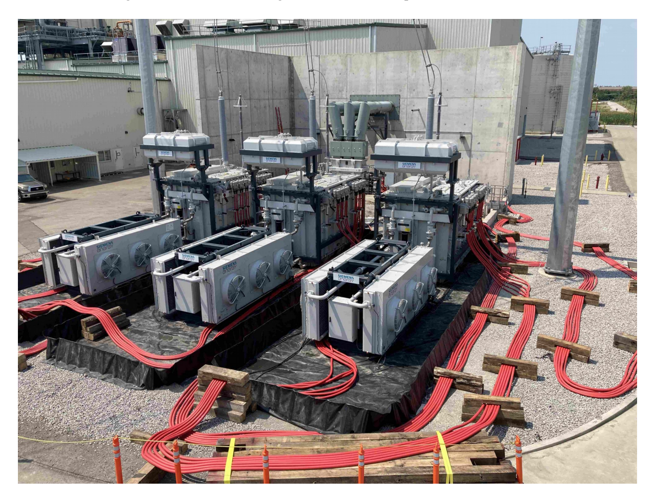
Figure 5 – 250 MVA bank – 345 kV Pretact<sup>™</sup> Resilience Generator Step-Up Transformers On site – Completely installed and energized

The replacement transformer was moved into its final location on the final day (day 7) of removal/decommissioning activities of the Pretact Resilience GSU. Activities to get the replacement unit ready for service immediately commenced and the unit was placed back in service as soon as the installation, testing and final commissioning activities were completed.